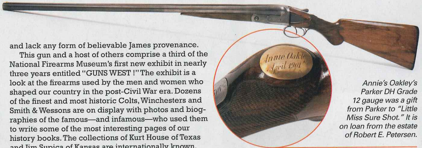
Annie's Oakley's Parker DH Grade 12 gauge was a gift from Parker to "Little Miss Sure Shot." It is on loan from the estate of Robert E. Petersen.

Shows such as "Davy Crockett" and "Daniel Boone" developed great following among the baby boomers of the post-World War II generation. Hardly a schoolyard in the 1950s was without an improvised "Fort Apache" where dozens of coonskin-cap-wearing tykes relived the roles of their heroes as seen on television the evening before. As they grew to adulthood, they carried with them their love of